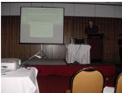
Paul presenting at the conference in Brisbane 5/7/04

Newsletter information please forward with approved pictures via email: